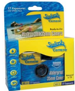
Splash Camera item # 62451