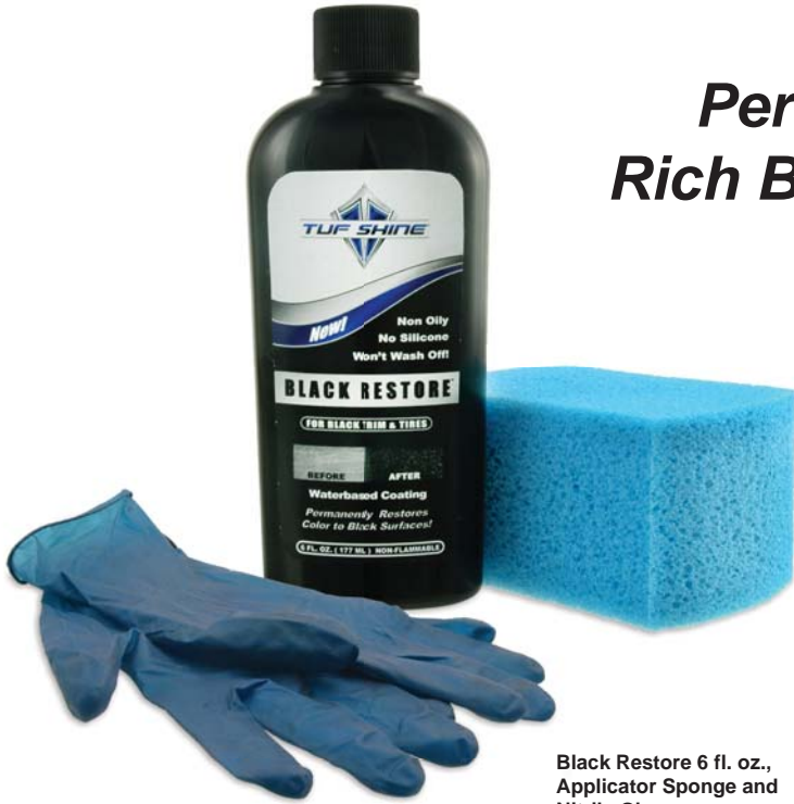
Black Restore 6 fl. oz., Applicator Sponge and Nitrile Gloves

Permanently Restores Deep Rich Black Color to Dull Surfaces.