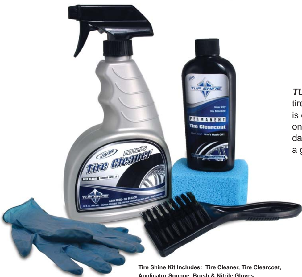
Tire Shine Kit Includes: Tire Cleaner, Tire Clearcoat, Applicator Sponge, Brush & Nitrile Gloves

TUF SHINE seals, shines and protects your tires permanently without the mess. TUF SHINE is dry to the touch, repels dirt, and will not sling onto paint or wheels. It protects against sun damage, seals in factory lubricants and provides a great shine with minimal effort.