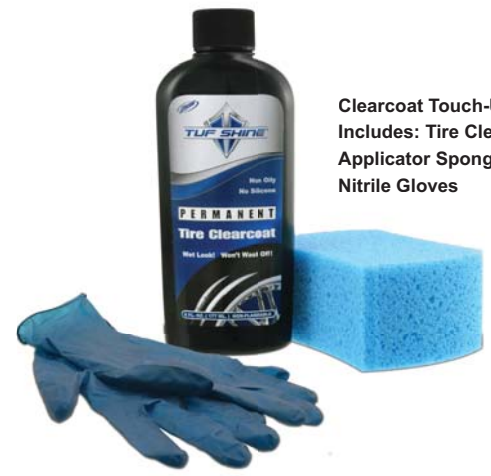
Clearcoat Touch-Up Kit Includes: Tire Clearcoat, Applicator Sponge and Nitrile Gloves