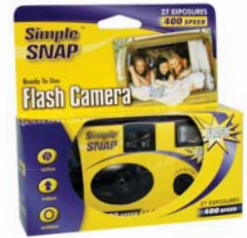
Simple Snap Flash Camera item # 62000